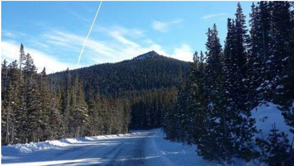
Mestaa'èhehe Mountain in Clear Creek County

As you prepare for your summer tours into the foothills, note a name change of a mountain near Mt. Evans. In December the US Board on Geographic Names voted to re-name Colorado's Squaw Mountain that sits between Evergreen and Idaho Springs off Highway 103, also known as Squaw Pass Road.