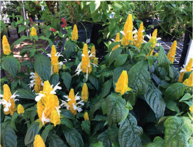
Golden shrimp plant

A yellow flowering plant that is often overlooked in the garden is the yellow shrimp plant, or Pachystachys lutea . This plant will bloom most of the year, but does most of its growing during the hot summer months. The shrimp plant, like pentas, salvia and porterweed, should be pruned to encourage new growth and blooming.