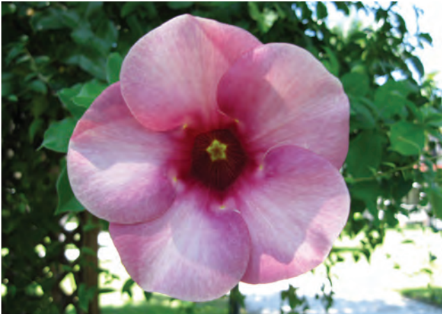
Cherries Jubilee allamanda

Visitors can see these plants and trees growing at Edison & Ford Winter Estates and learn how to care for them at the monthly Garden Talks. Young plants and trees are available for purchase in the Garden Shoppe, so gardeners can create their own flowering paradise and enjoy Indian summer, Florida style!