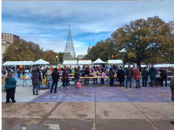
Collecting for the Backpack Ministry