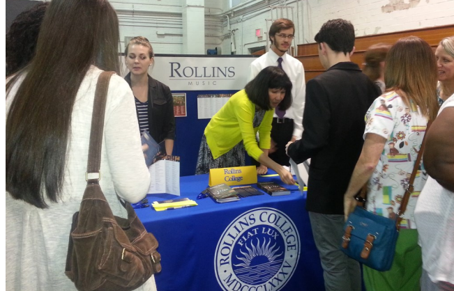
College Night 2013

The Band Boosters are coordinating the event this year, however, each music department has been asked to help by supplying volunteers and food. Requests for help will be sent in a separate email.