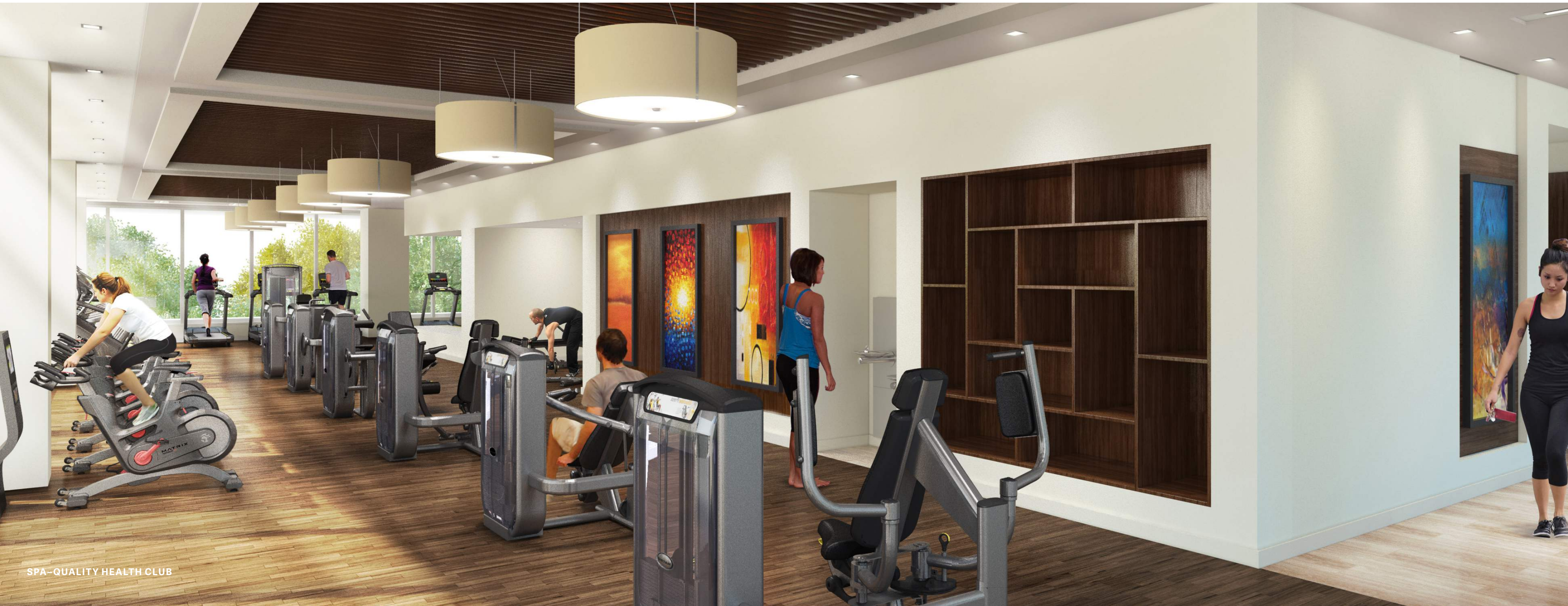
SPA-QUALITY HEALTH CLUB