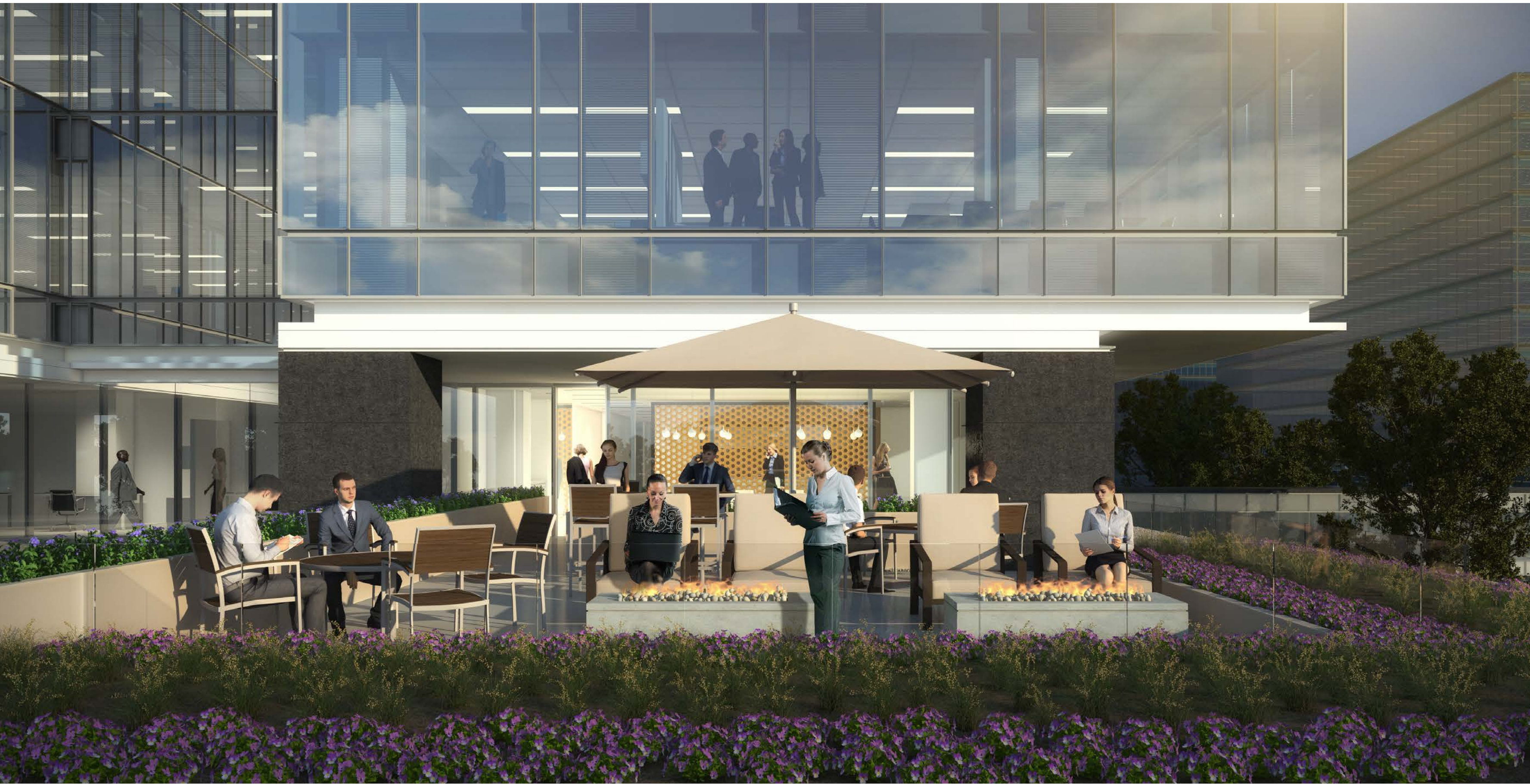
ELEVATED OUTDOOR TERRACE