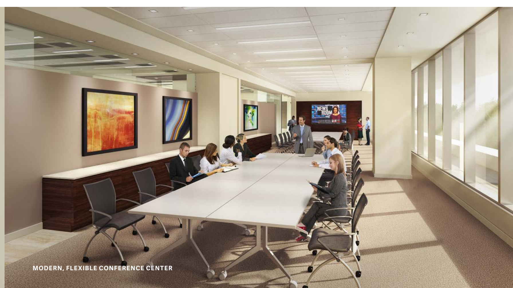
MODERN, FLEXIBLE CONFERENCE CENTER