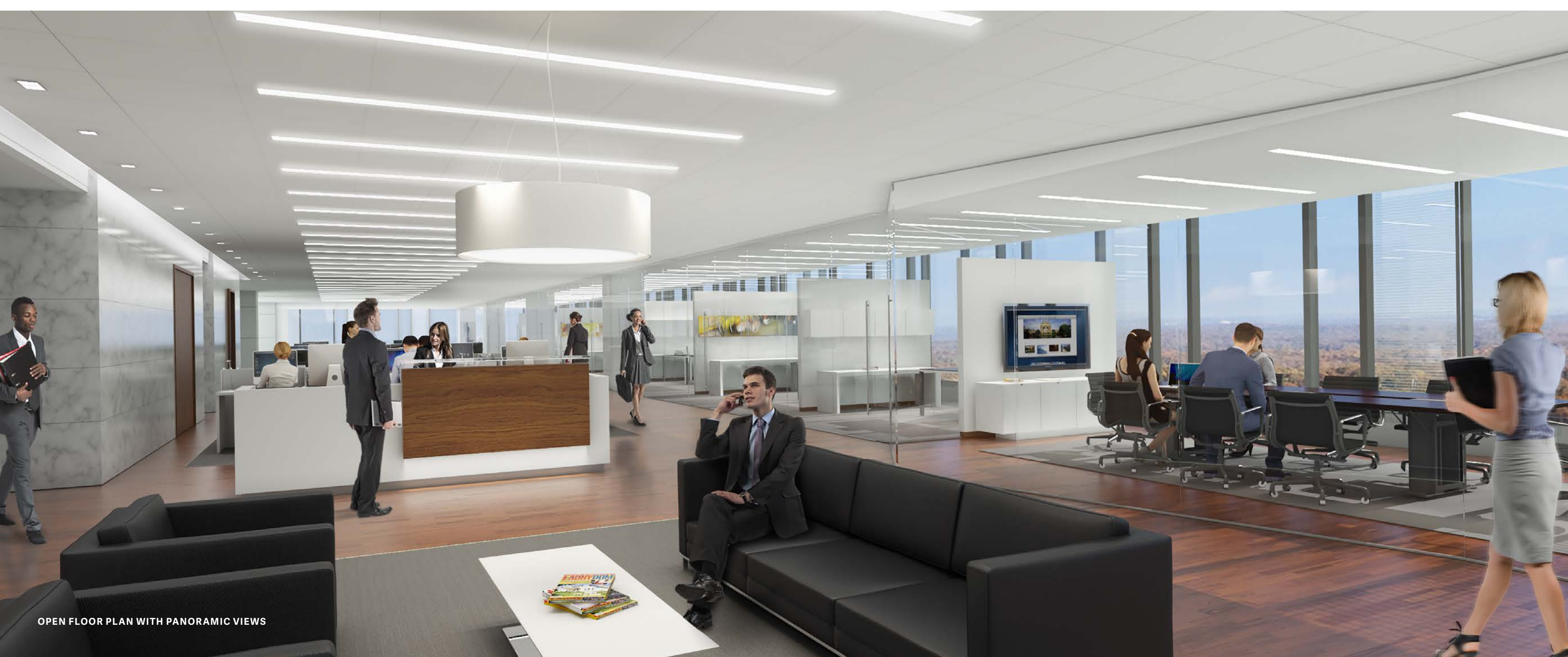
OPEN FLOOR PLAN WITH PANORAMIC VIEWS