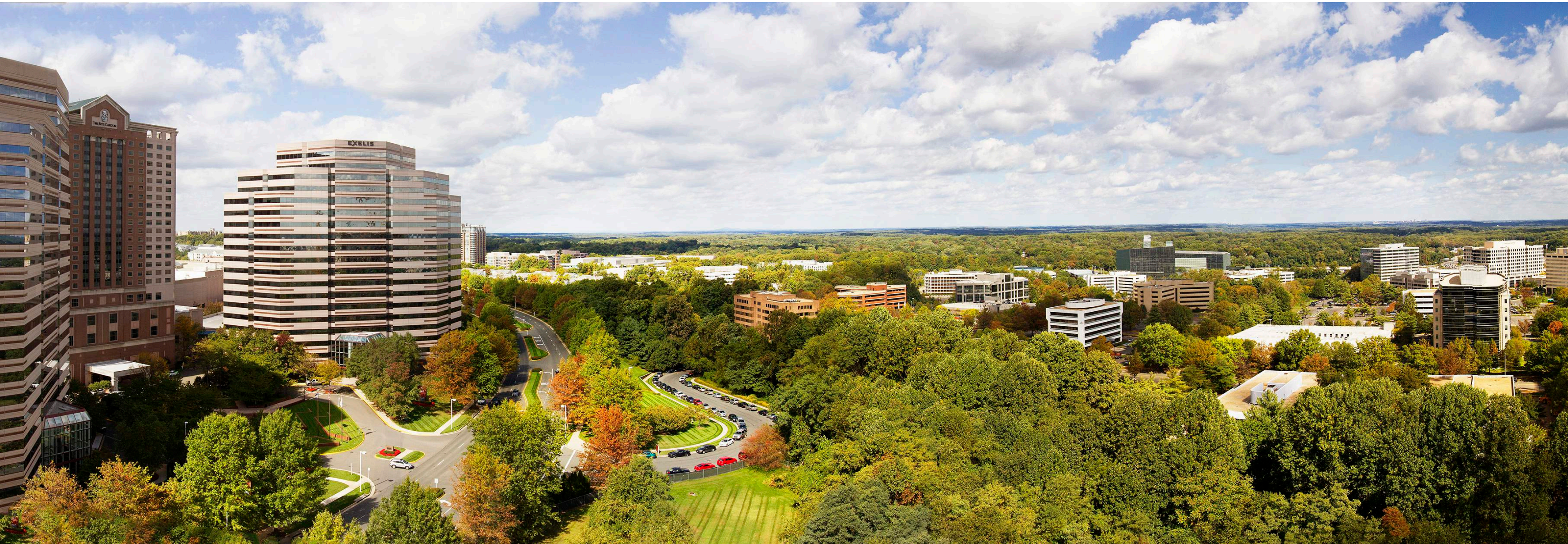
View North from 1775 Tysons Boulevard