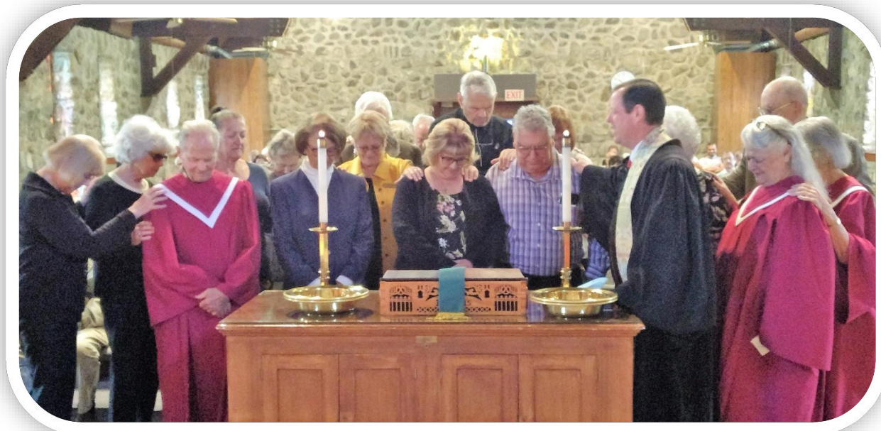
Praying for new members.