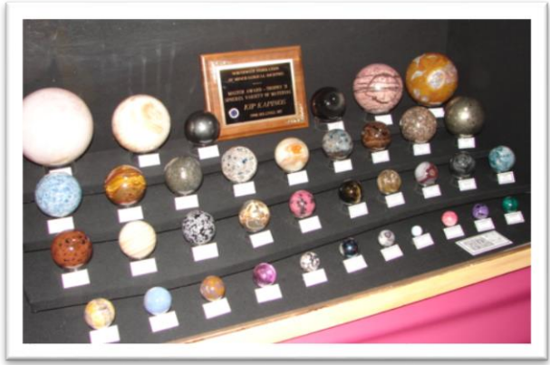
Rock & gemstone spheres – a show photo