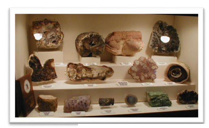
Petrified wood exhibit - Don & Pat Snyder