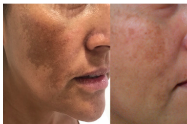
Laser removal of Melasma on the face — Before & After