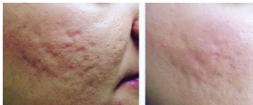
Acne scars Before & After Fraxel laser