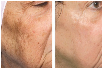
Before & After Laser of Melasma