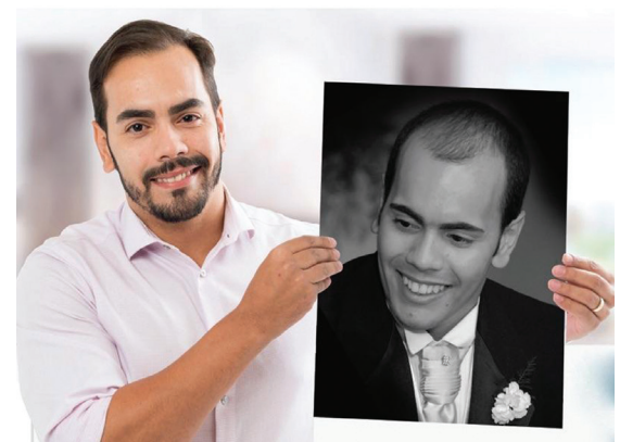
Before & After hair transplant

Beverly Hills Cosmetic & Laser Center Innova Surgical Institute of Beverly Hills 435 North Roxbury Dr, Suite 405 Beverly Hills, CA 90210 Office: 310.275.4155 ■