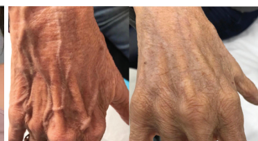
Filler for hands Before & After