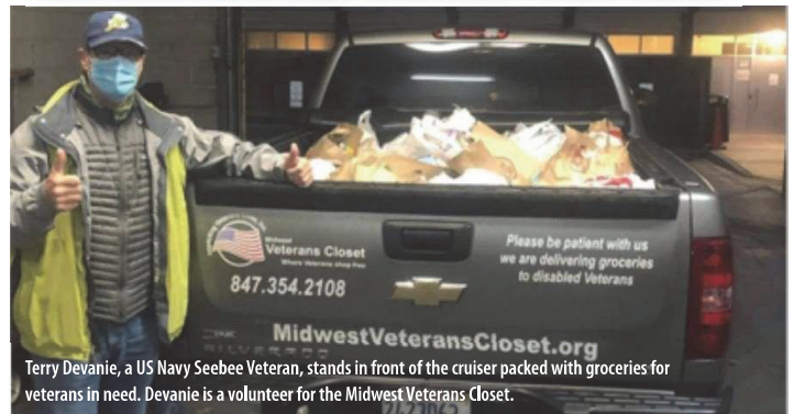
Terry Devanie, a US Navy Seabee Veteran, stands in front of the cruiser packed with groceries for veterans in need. Devanie is a volunteer for the Midwest Veterans Closet.