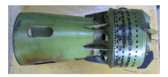
Figure 3: Tubular Combustor of Rover turbine

Marcus [31] has experimented wood gas to run a gas turbine and find its suitability with Rover 1S 60 gas turbine.