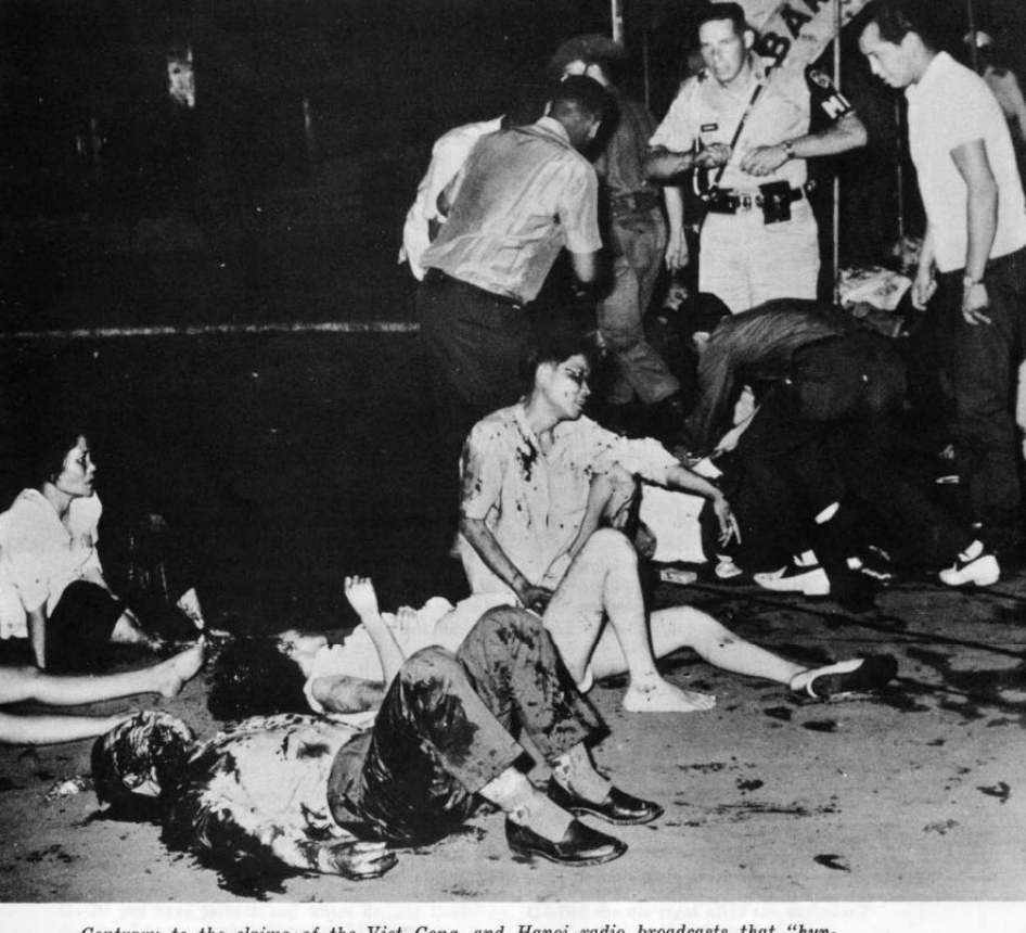
Contrary to the claims of the Viet Cong and Hanoi radio broadcasts that "hundreds" of Americans were killed and injured, most of the victims were Vietnamese.