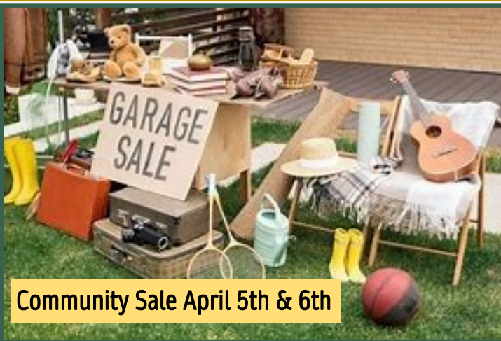
Community Sale April 5th & 6th

Any one interested in volunteering for Social Committee—