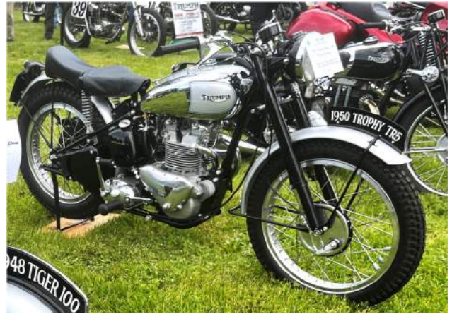
Tom Ruttan's 1950 Triumph Trophy TR5, 500 cc. The square barrel engine was only produced for two years.