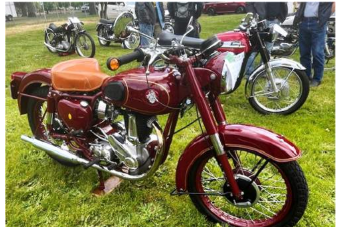
1958 BSA B33, 500 cc.