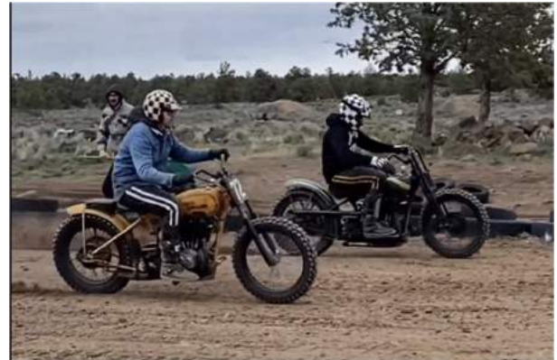
Two Harley JDs in vintage race.

The Steel Stampede was held at the Deschutes County Fair & Expo Center. On Saturday, May 4 th, they held American Historic Racing Motorcycle Association sanctioned trials and on Sunday, May 5 th, they held vintage motorcross racing. OTC had a booth and some OTC members participated in the races.