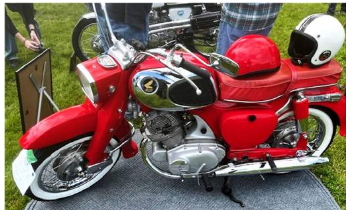
1967 Honda Dream 305 cc