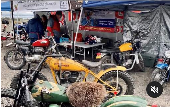
OTC Booth at the Steel Stampede.