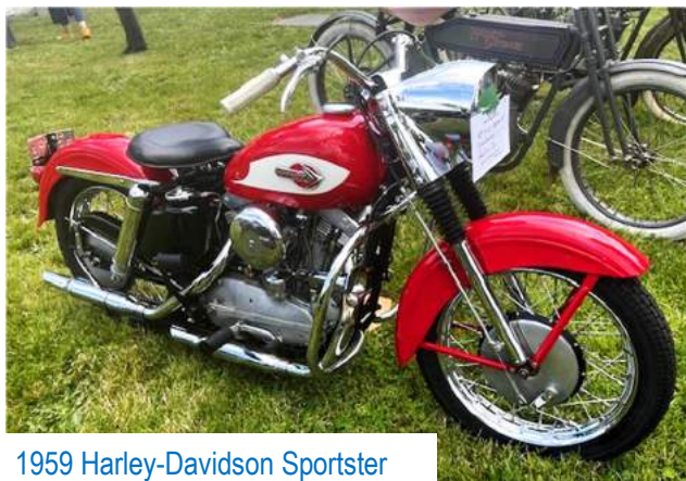
1959 Harley-Davidson Sportster