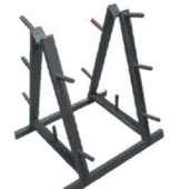
Accessory Rack 41FF03151