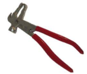
Weight Hammer 301400425