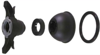
Manual Locking Kit 41FF83148