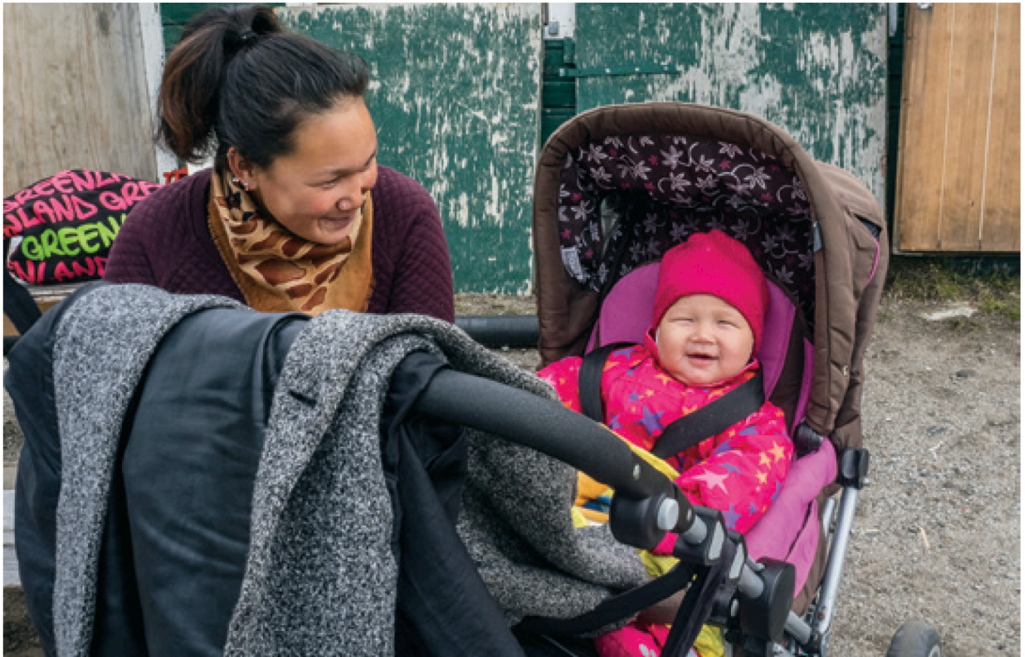
Happy Inuit Baby