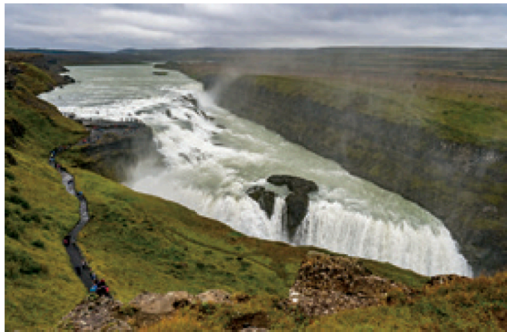
Largest in Iceland

The typical cruise is not particularly conducive to dedicated photography, but expedition cruising can be. It gets you to landscapes and wildlife you've never before experienced, and the results can be magical memories and awe-inspiring photographs! Why not give it a try? ■