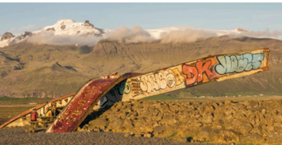
Remains of Bridge

The light in the higher latitudes can be soft and wondrous, a golden hour that lasts many hours. The time just before or just after a rainstorm often brings great shot possibilities of dramatic clouds, magical light, rainbows, and reflections.