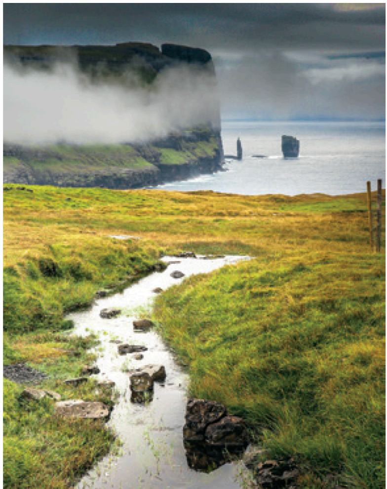
Fareo Is Stream

I strongly prefer making my own arrangements for photo touring rather than using the ship's bus tours. I love the freedom, the flexibility, and the sense of discover. Go online to cruise critic.com , and click on "roll call" to connect with fellow passengers on your upcoming cruise interested in sharing a cab/private tour.