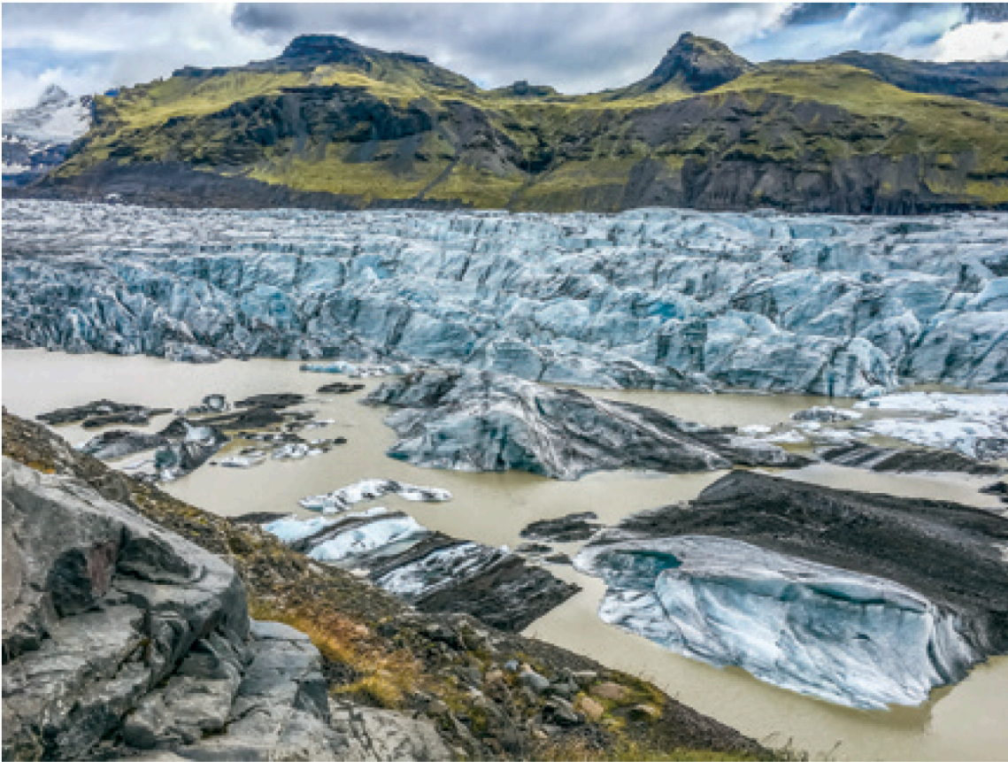
Unusual Glacier View

off immediately. As one tour leader at Europe's highest railroad said, "You have two to three seconds to get to the site, the waterfall or whatever, before fellow tourists will crowd into your view."