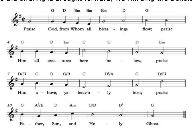
Doxology, written in England for Protestant Churches in 1674.

As the offering is brought forward, we will sing the Doxology.