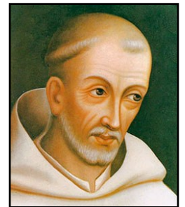
Feast Day: August 20

In the year 1111, at the age of 20, Bernard left his home to join the monastic community of Citeaux. His five brothers, two uncles, and some 30 young friends followed him into the monastery. Within four years, a dying community had recovered enough vitality to establish a new house in the nearby valley of Wormwoods, with Bernard as abbot. The zealous young man was quite demanding, though more on himself than others. A slight breakdown of health taught him to be more patient and understanding. The valley was soon renamed Clairvaux, the valley of light.