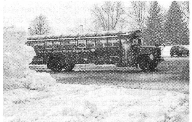
The OWLS bus in snowstorm 2-20-2014 while visiting museum

(Editor’s Note: This farm was located where the Lookout Bar and Grill is currently, 8672 Pineview Lane, Maple Grove).