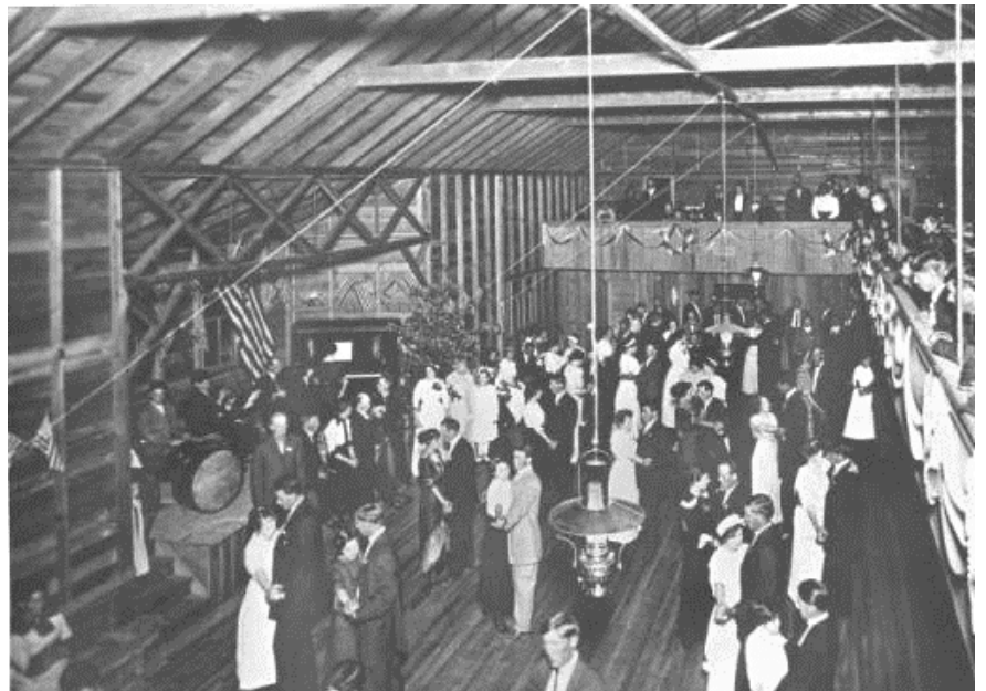
Dance at Dance Hall in Olga. c.1910's This dance was held at the dance hall in Olga. It may have been for Thanksgiving or Christmas as there is a Christmas tree near the stage at the center of the photo. The band, which consisted of a drummer, horn player, violinist, and pianist, is located on the stage at left. Many dancing couples filled the dance floor with some onlookers around the edges and looking over the balcony which had tables set for a dinner. Oil lamps are suspended from the center rafter on pulleys and other lamps provided light on the tables and stage. The woman in the lower left corner was Mrs. Moore, niece of Chief Seattle and daughter of Princess Evangeline. [Note: location and photo subjects identified by Jane Barfoot-Hodde.]