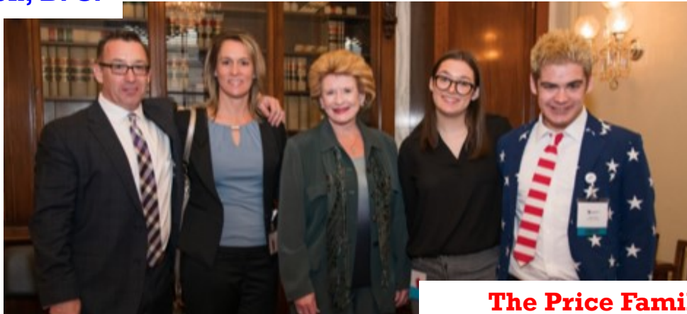
The Price Family with Senator Debbie Stabenow