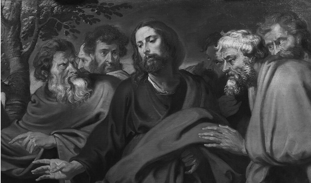
Christ and the Apostles, Anthony van Dyck, 1599-1641