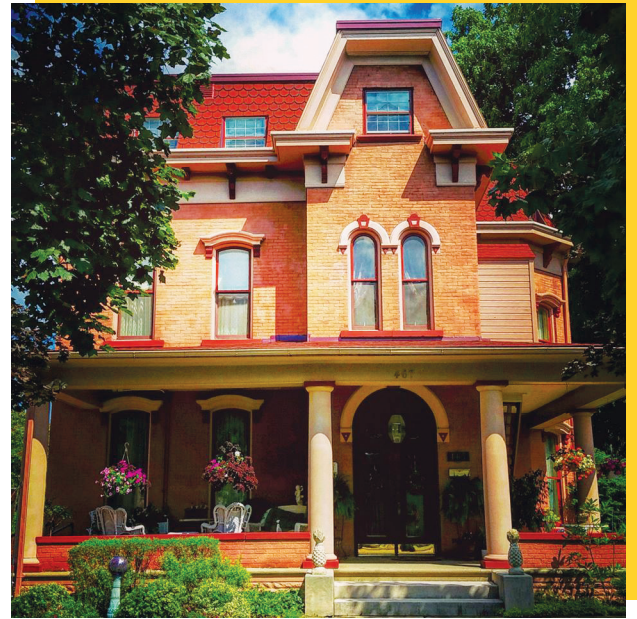
Magnolia Manor Bed and Breakfast and Tea Room

To make reservations, call Marlena Allen at 330-204-2477.