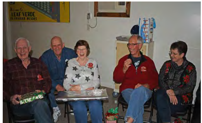
Smiles say it all!