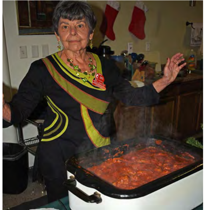
Dinner was a full on Italian past dinner and all the sides.