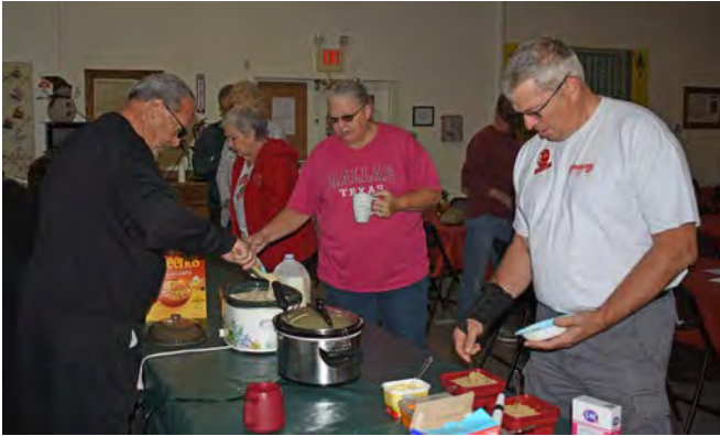
Friday morning the co-hosts prepared oatmeal with all the fixings