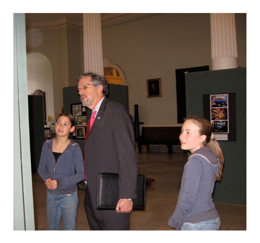
Photo: Students Meet with Massachusetts Secretary of Education, Paul Reville