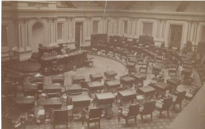
The Senate Chamber, in Later Years

One final roadblock needs resolution before the Legislative branch plan is finalized. It involves fear among the larger states that “money bills” (taxing and spending) coming out of the “equalized Senate” might be tilted unfairly against them by the smaller states.