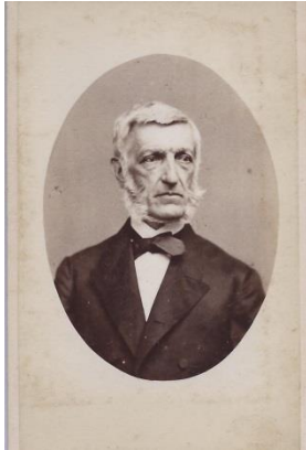
George Bancroft (1800-1891) Who Nominates Polk

Based on the collapse of the Whig agenda after Harrison’s death, and their strong showing in the 1842 off-year elections in the House, the Democrats are confident they can retake the presidency in 1844.