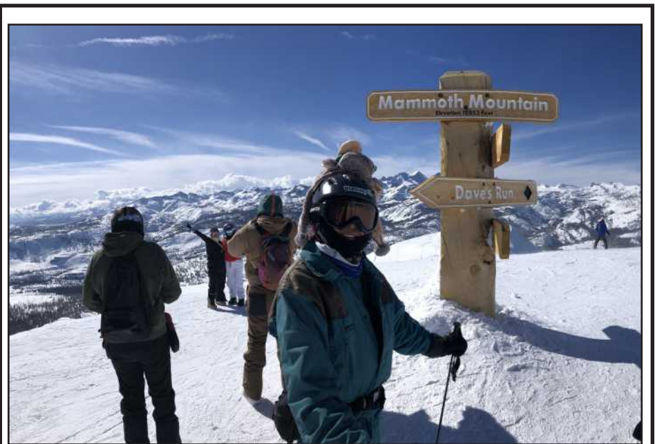
The Unrecables enjoy tons of snow at Mammoth in March.