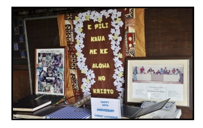
35th Anniversary of Christ Lutheran Church