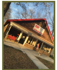
Kansas Property Place