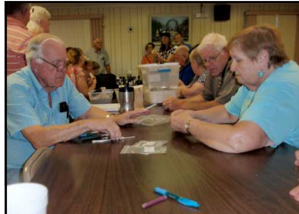
Members deep in discussion.