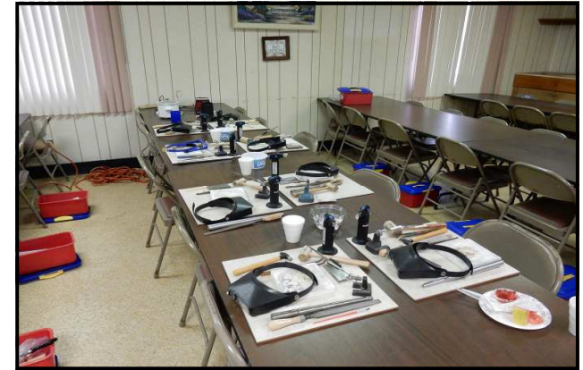
Work area ready for the silver smithing class.