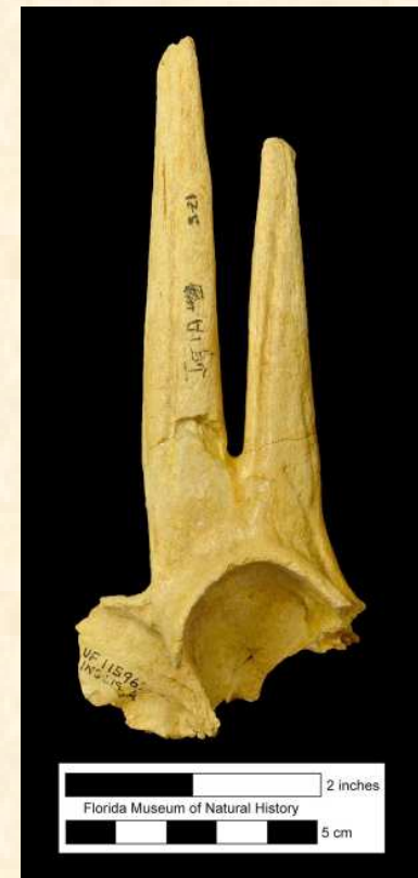
Capromeryx antelope jaw from Inglis