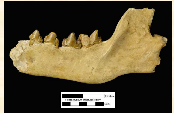
Chasmaporthetes jaw only NA hyena from Inglis