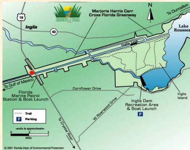
Map of Inglis area and part of the barge canal. Red dot is