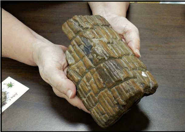
Linda Spaulding's newly acquired fossilized wood.