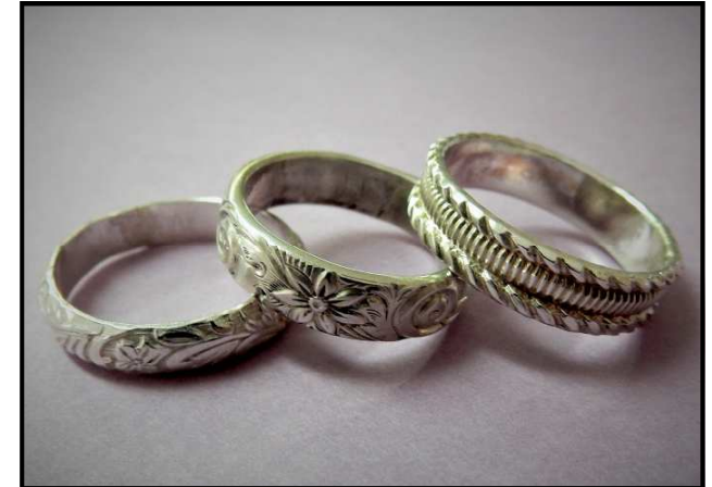
New rings made by Withlacoochee Rockhounds.