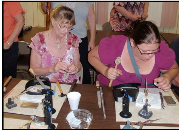
Club members participating in the ring making class.