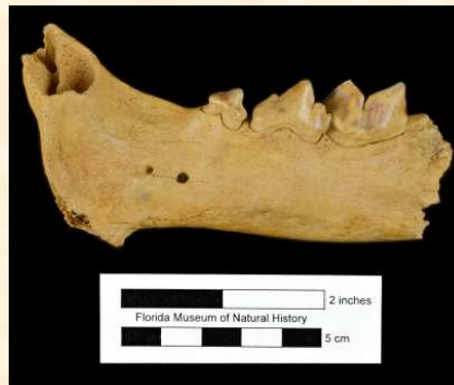
Smilodon saber tooth cat jaw found at Inglis