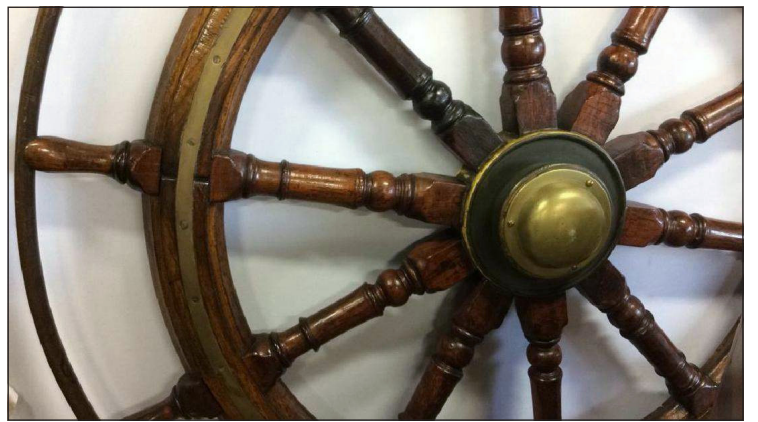
An antique brass, wood and iron ship's wheel with turned spokes, 5 feet in diameter.