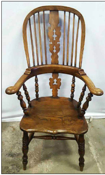
One of a set of six broad arm Windsor chairs originally purchased in Lancashire, England, circa 1840s, and curated for the estate by designer Bunny Williams.

The enamelware kitchen implements we see today originated in Germany and initially covered only the inside of the cast iron cooking vessels. The intent was to eliminate metallic and rust flavors, along with cutting down on scrubbing to clean. By the late 1800s Americans were mass-producing far more attractive enameled cookware. Antique enamelware in turquoise, white spackle and vibrant blue, formed into pitchers, pots, canisters and coffee pots are now decorative and were present in the Nantucket