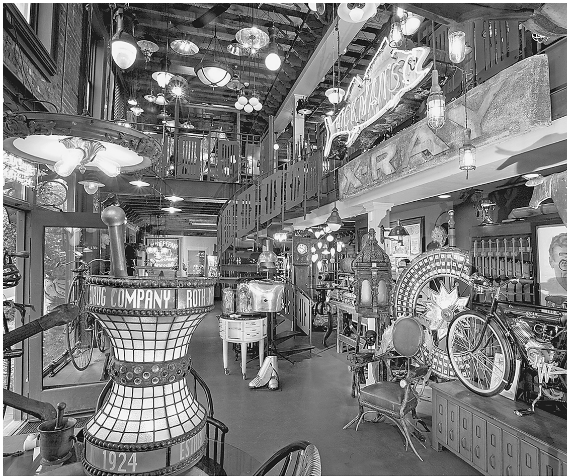
Radio Guy Antiques and Early Electrics Lighting can be found in our 150 year old landmark building on the Hudson River. We are open 6 days a week, Monday through Saturday 9 to 4.