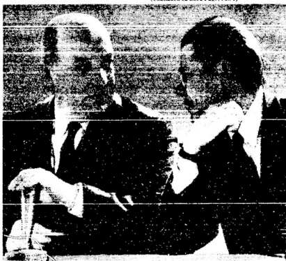
It's a quiet moment on television as Defense Secretary Robert S. McNamara leans over a word with Secretary of State Dean Rusk during discussion of Far East events.