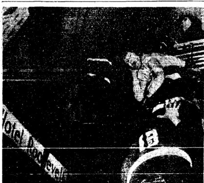
Firemen rescue a screaming woman during South End. Nine were killed and 15 injured, 5 more which swept the Hotel Roosevelt in Boston's critically, in the fire.

North of Saigon, in the Central Highlands, two provincial capitals that have been under virtual siege for the past several weeks were reported quiet Sunday. They are the towns of Pleiku and Ban Me Thuot.