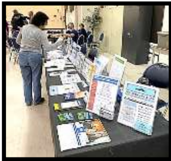
Flyers, Brochures, etc. to share