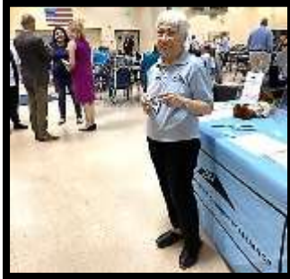
Goldie welcomes all!