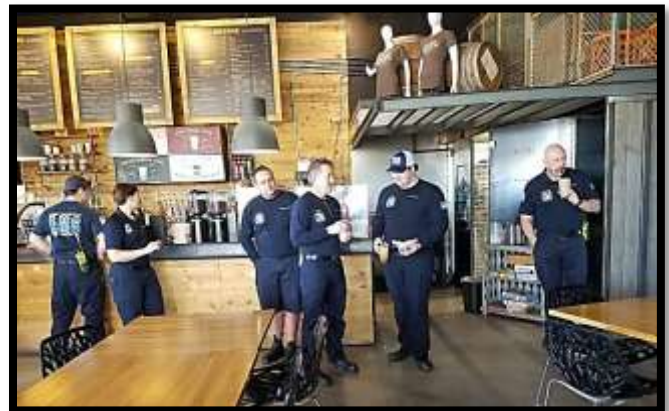
A few of the First Responders that attended.