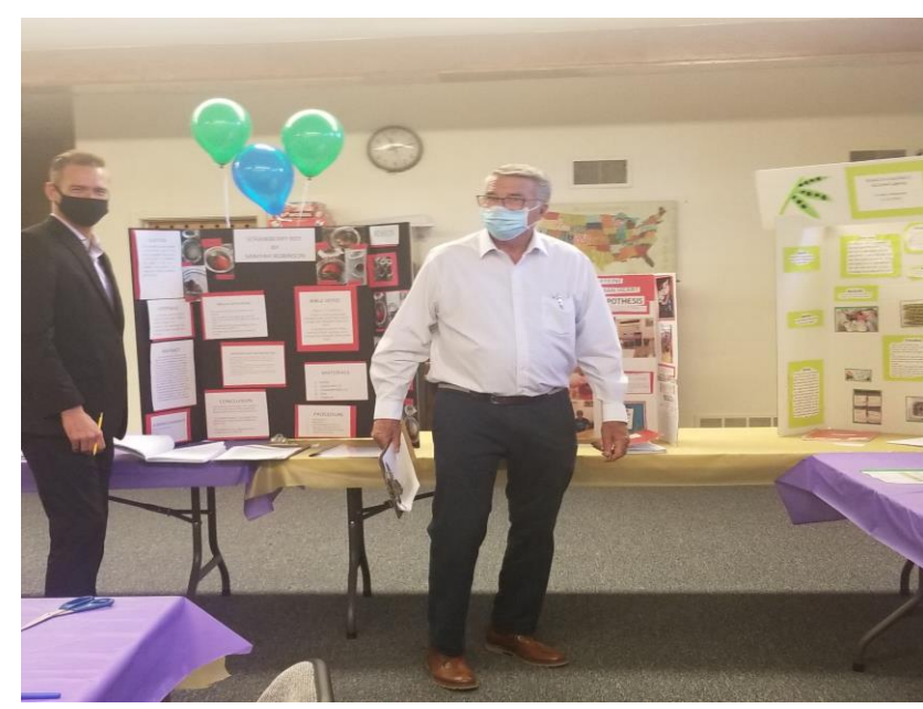
Above: Annual ICS Science Fair-Community Volunteer Judges. Below: Spirit Week Fun – The "Bee-Attitudes"