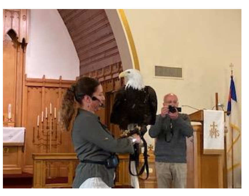
Above: Eagle Presentation – Raptors Education Foundation Below: Historical Field Trip – Washington, D.C