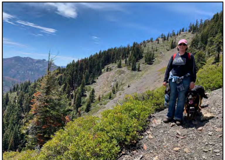
Day hiking on the Pacific Crest Trail north of Carter Meadows.

Recreation.gov: If you plan on camping at any established and maintained horse camp in the U.S., you’ll likely need to reserve and pay for your spot ahead of time at https://www.recreation.gov/ .