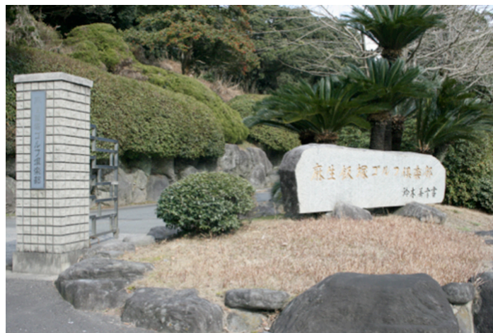
A view of the front gate at the Aso-Iizuka Golf Club, of which former Japanese prime minister Taro Aso is chairman. (Kim Hyo Soon)

A map of such burial sites for the dead of Yoshikuma Mine without surviving family, drafted by Aso Mining for internal use, was filled with records of where remains were located. It indicated there were no fewer than 504 sets of remains. Thirty-three had stone markers, twenty-one had wooden markers, and the remaining 450 had no markers at all. The map was never disclosed by Japanese media. It is now almost impossible to determine the identity of the remains, since any materials that might provide a clue are no longer extant. Nearly all of the Japanese who did physical labor in mines during the Japanese Empire were from the lower class. Second and third sons of poor farming villages without rice paddies to inherit went to work at the mines if they had no better means of survival. A number of them were burakumin, subject to discrimination from society. When people died, those who had no one to take their remains were simply buried in the ground. Even if there was an intention to cremate them, the high price of coal resulted in their effective abandonment.