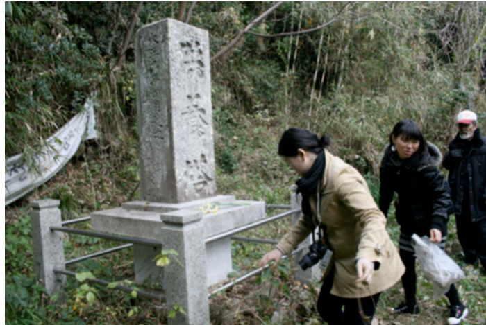
Staff members of the Oka Masaharu Memorial Nagasaki Peace Museum clean the “Senninzuka” memorial tower, which originally contained an ossuary underneath.

of Korean Residents in Japan (Chongryon). It was in the midst of this controversy that the destruction of the inscription took place.