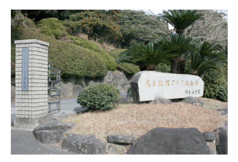
A view of the front gate at the Aso-Iizuka Golf Club, of which former Japanese prime minister Taro Aso is chairman. (Kim Hyo Soon)

A map of such burial sites for the dead of Yoshikuma Mine without surviving family, drafted by Aso Mining for internal use, was filled with records of where remains were located. It indicated there were no fewer than 504 sets of remains. Thirty-three had stone markers, twenty-one had wooden markers, and the remaining 450 had no markers at all. The map was never disclosed by Japanese media. It is now almost impossible to determine the identity of the remains, since any materials that might provide a clue are no longer extant. Nearly all of the Japanese who did physical labor in mines during the Japanese Empire were from the lower class. Second and third sons of poor farming villages without rice paddies to inherit went to work at the mines if they had no better means of survival. A number of them were burakumin, subject to discrimination from society. When people died, those who had no one to take their remains were simply buried in the ground. Even if there was an intention to cremate them, the high price of coal resulted in their effective abandonment.