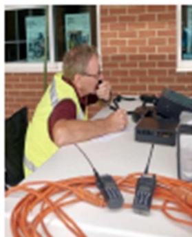
ARRL Field Day 2023