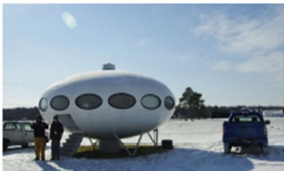
Interesting Place for a Winter Field Day!

SARA, a 501c (3) non-profit organization, was founded in 1979 and provides VHF and UHF repeaters for use by all Hams, and by Regional Nets, Skywarn, Sussex County Amateur Radio Emergency Service (ARES) and Sussex County Auxiliary Communications organization (AuxComm). While Hams have fun, the best part of SARA is the friendships you make!