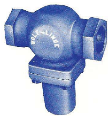
CATALOGUE # SCREWED STRAINERS

TYPICAL (1" HAS SCREWED BONNET) 1-1/4 THRU 2" AS SHOWN HORIZONTAL TYPE-SHOWN ANGLE TYPE IS ALSO AVAILABLE (NOT SHOWN)