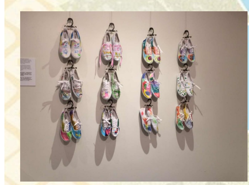
In Their Shoes Exhibition