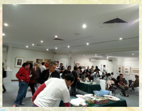
In Their Shoes Exhibition