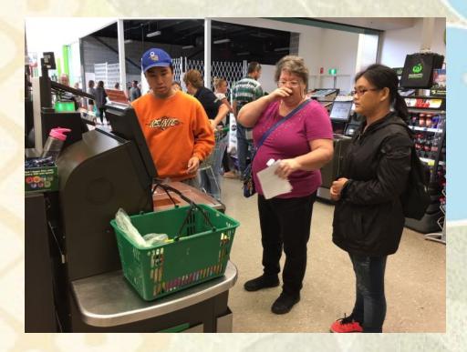
Money Skill Training