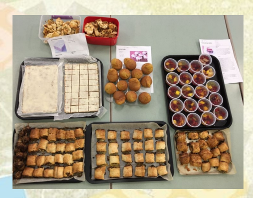
Living Skills Program—Cooking