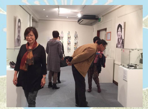
In Their Shoes Exhibition