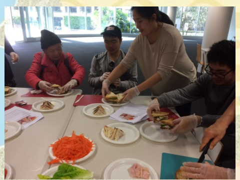
Fairy Bread Day