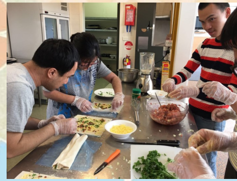
Living Skills Program—Cooking