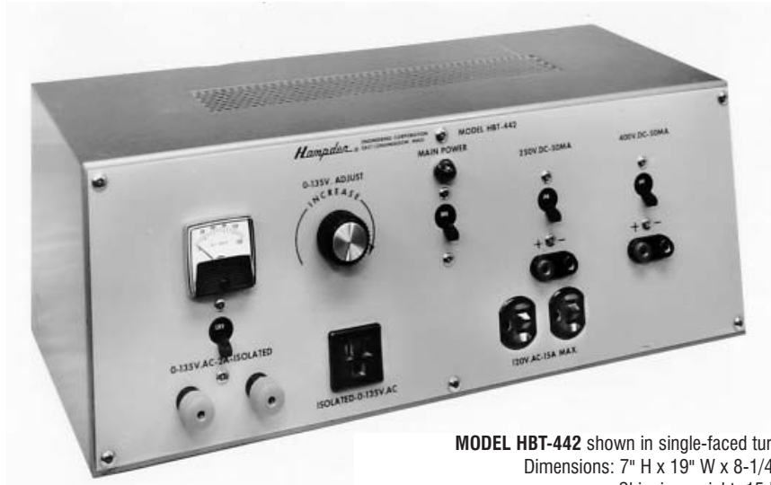
MODEL HBT-442 shown in single-faced turret. Dimensions: 7" H x 19" W x 8-1/4" D Shipping weight: 15 lbs.

The output of the isolated AC Supply is continuously monitored by a built-in-voltmeter.