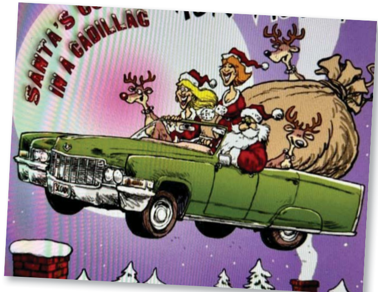
Merry Christmas and wishing you a Merry 2023. We're guessing Santa had the jumper cables on his '70 Caddy to be ready for the big day.