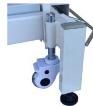
Dual Ball Bearing Castor Wheels