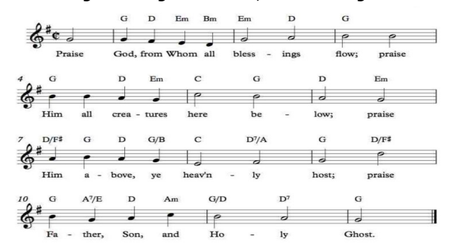
Doxology, written in England for Protestant Churches in 1674.

As the offering is brought forward, we will sing the Doxology.