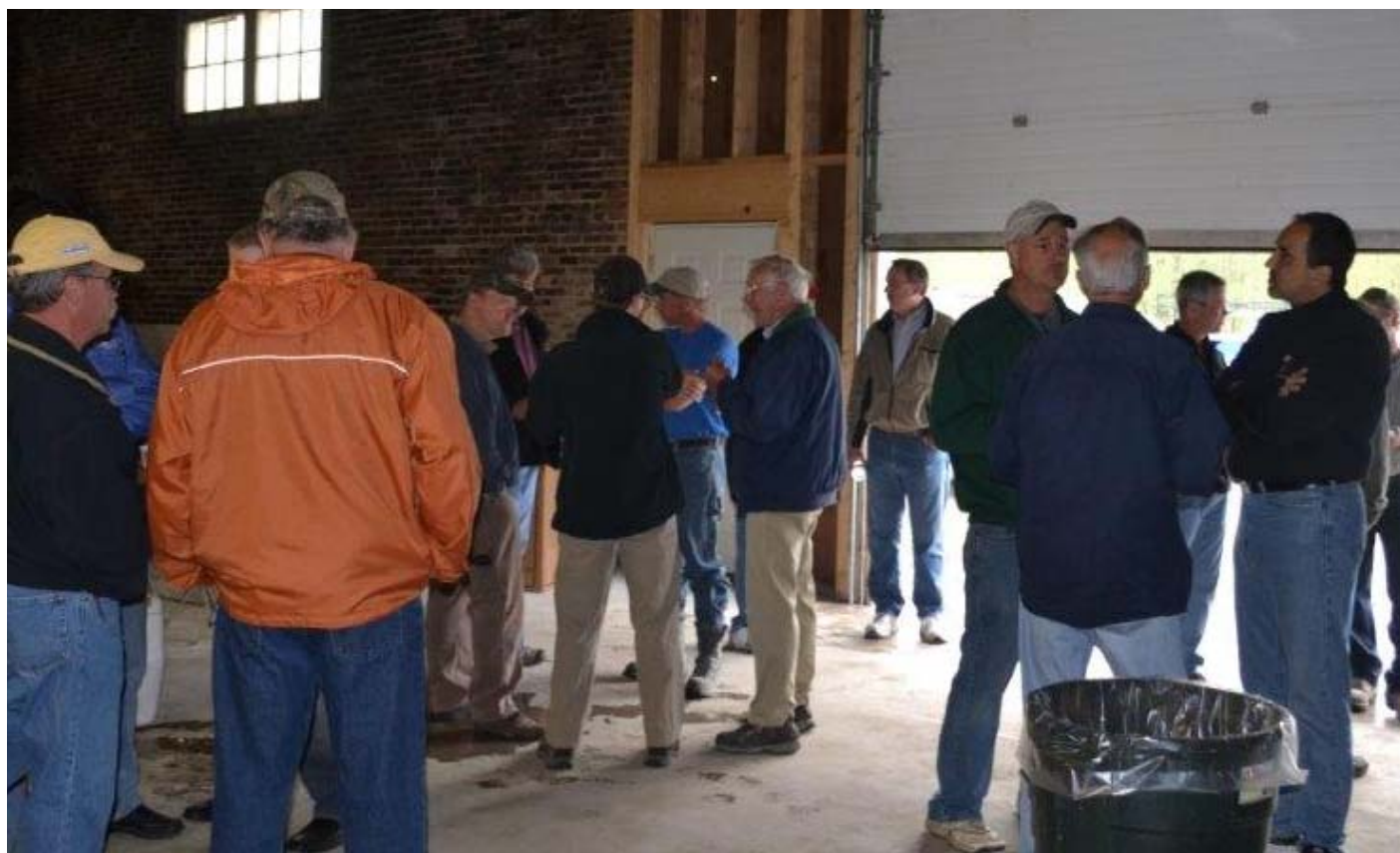
Drillers and pump installers gather and exchange information during the Spring Demo. Many thanks to Preferred Pump for providing the space.

The local source you can trust For water well rigs, parts and service