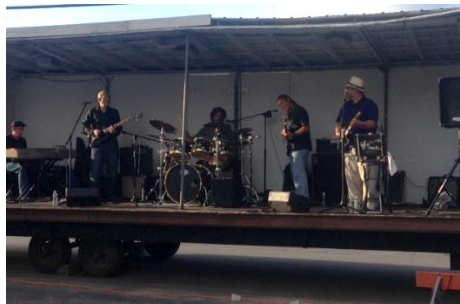
Bikes line Broad Street while Friar's Point Band performs during the Bikes, Blues & BBQ Event.