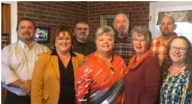
Our Worship Team

Members of the Team said that they had a wonderful time at the Homecoming (and that the food was excellent!).