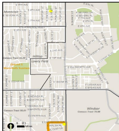
Site Overview (Council, Neighborhoods, Census Tracts)