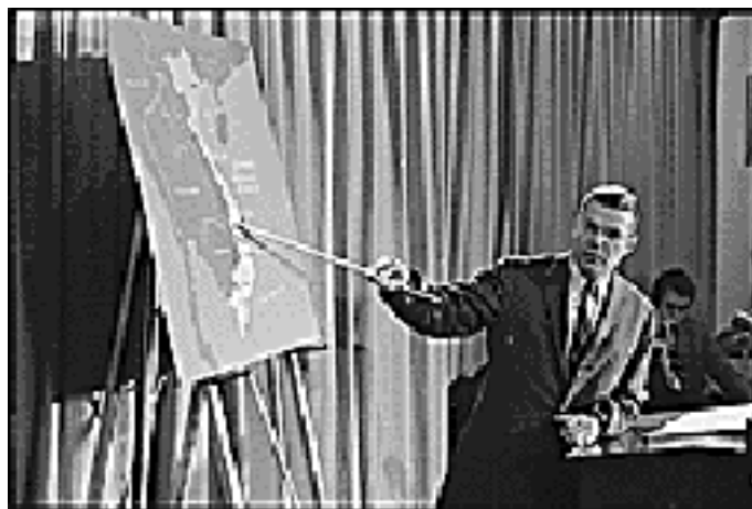
Secretary of Defense Robert S. McNamara's February 1965 press conference at the Pentagon. (Photo taken February 7, 1965.)