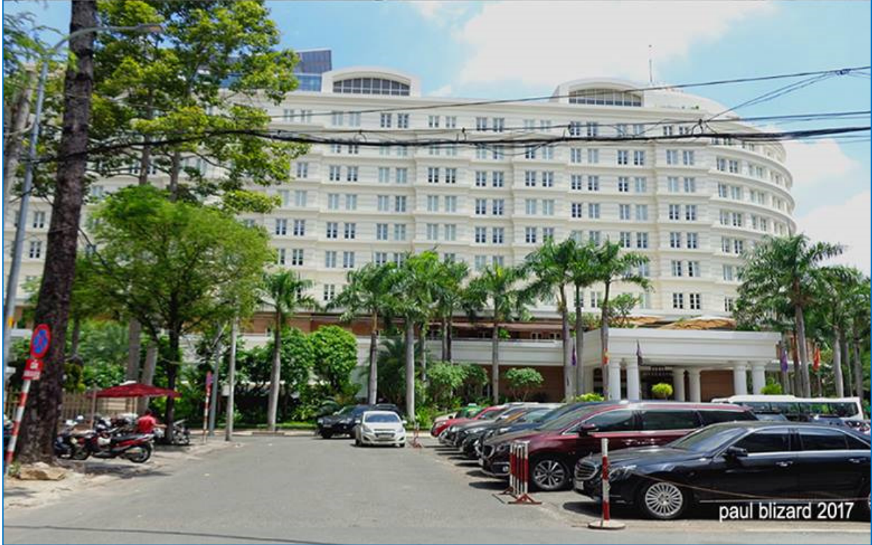
The top photo is the Brink Hotel after the bombing. The bottom photo is of the new Park-Hyatt Hotel in the same location today.