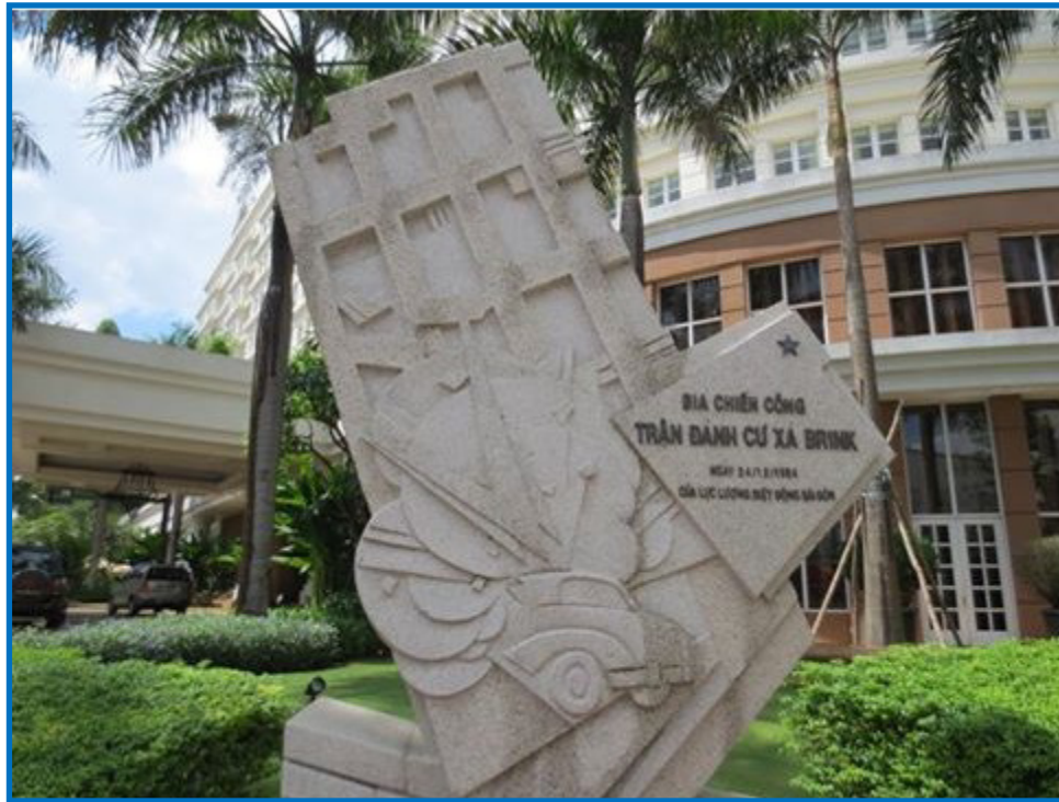
The Memorial to the Brink Hotel bombing as of 2015.