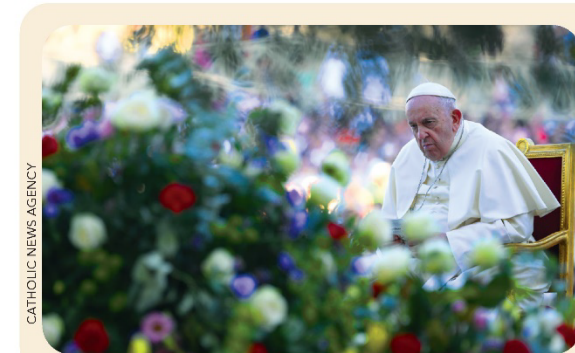
CATHOLIC NEWS AGENCY